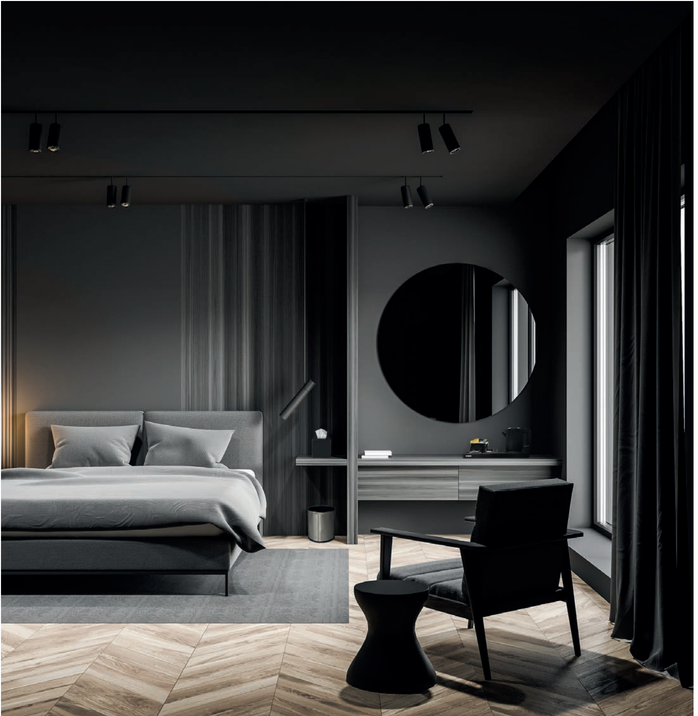
Electricals for the hotel guest room